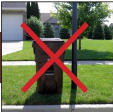
Cart is too close to pole.