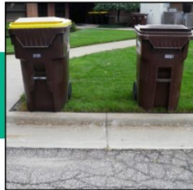
Cart is facing forward, within 3 feet of the street edge, unobstructed with a minimum of 2 feet clearance.