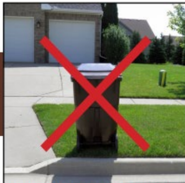
Cart is not facing forward. (Number stamp and metal bar should be facing the street.)